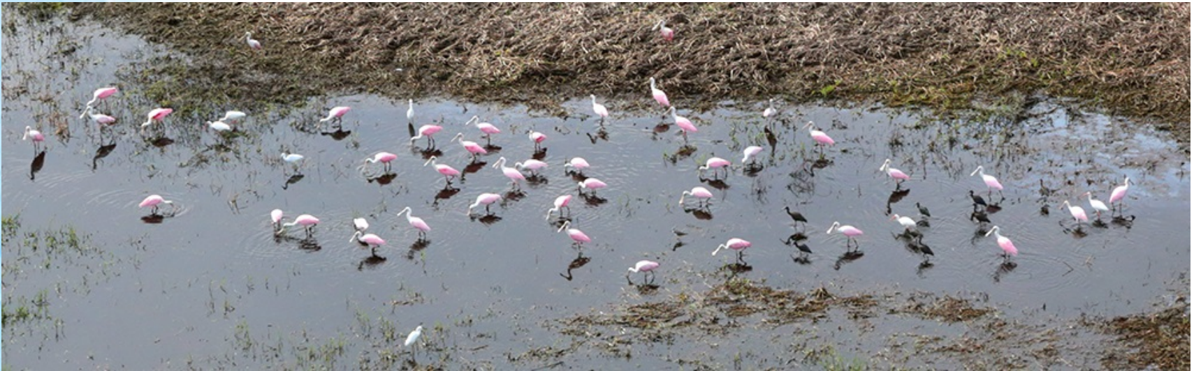
Roseate spoonbill, ibis, and egrets forage in a drying pool in the Phase I restoration area floodplain (December 10, 2015)