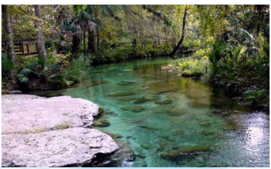
Kelly Park / Rock Springs