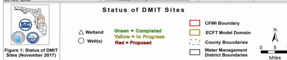
Figure 1: Status of DMIT Sites (November 2017)